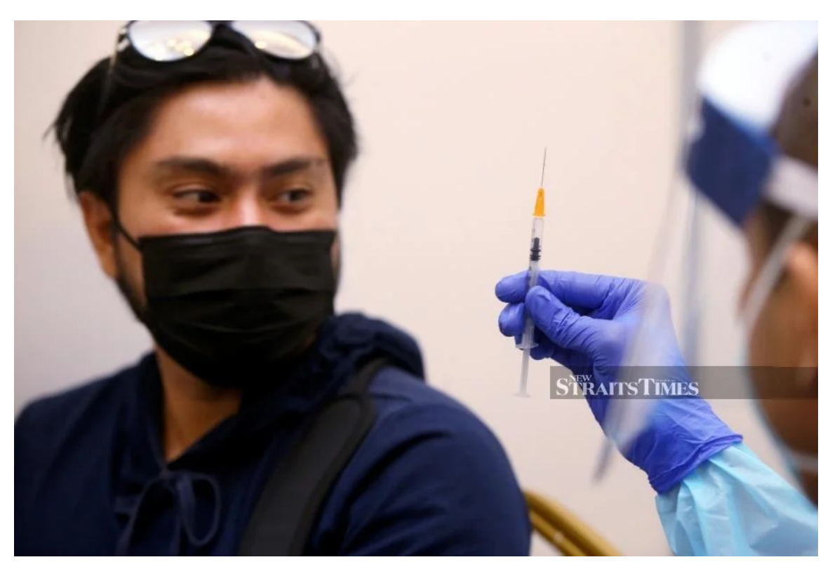
Covid-19 vaccine recipients can now document their immunisation process as evidence.

Previously, the public was not allowed to record themselves when receiving the vaccine jab, and only allowed to take photographs at an allocated photo booth in the vaccination centre (PPV) after the process.